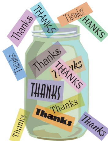
Overflowing With Thanks