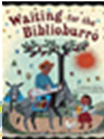
February's book visits Columbia and talks about mobile libraries like our bookmobiles.