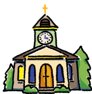
Pastor's Office Hours

Office Hours Monday-Thursday 9-12 Afternoons by appointment