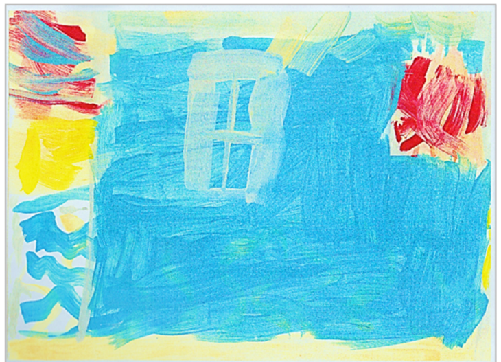
"House on Fire" - Micah Feenstra.