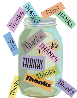
Overflowing With Thanks