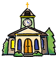
Pastor's Office Hours