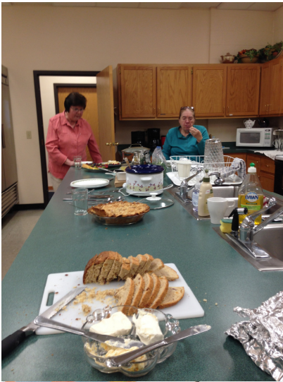
Food from the Netherlands