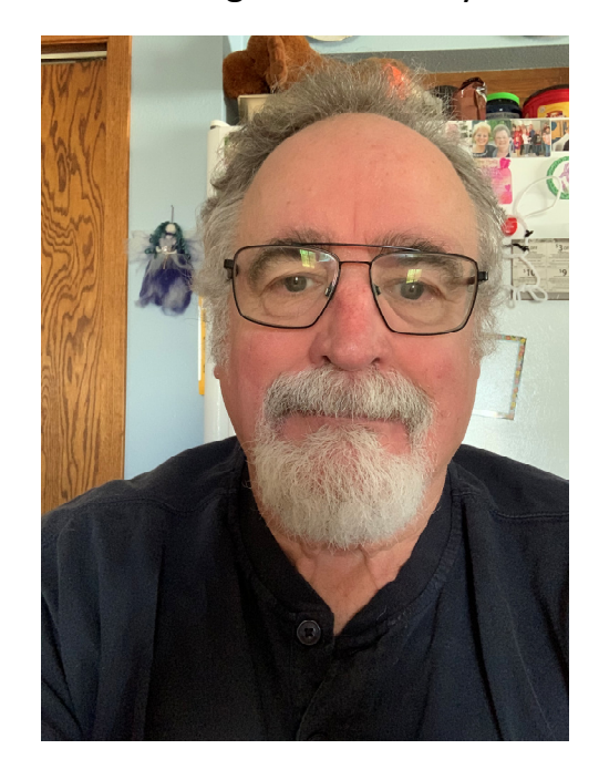
Continuing to heal and taking it one day at a time.