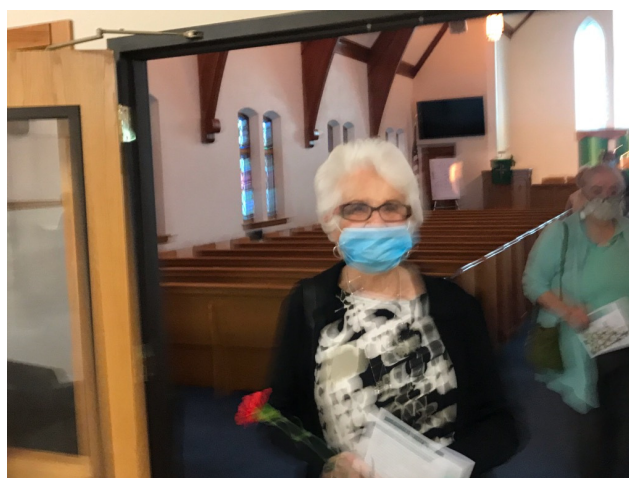
Ginge-member for 64 years