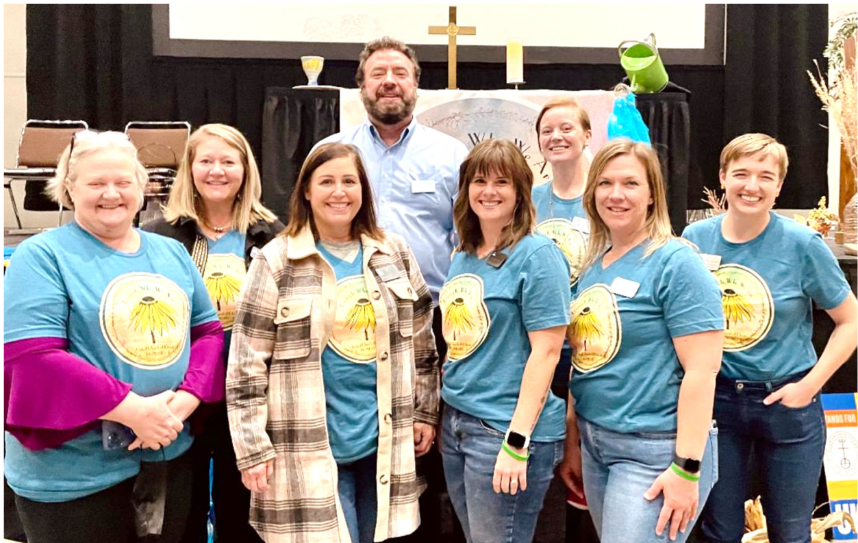
Iowa, Nebraska & South Dakota Conferences staff – (Left to right)