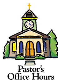
Pastor's Office Hours

Monday-Thursday 10-4 Other times by appointment May be out of the office for meetings or visits