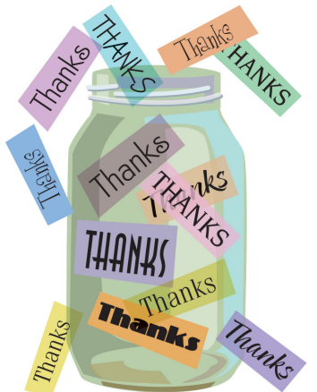
Overflowing With Thanks