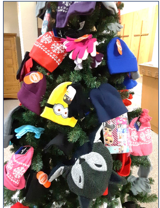
December 2020 - Giving Tree was overflowing for the children of Westside Elementary. Thanks to all who donated, including many from our Linaje Escogido friends!