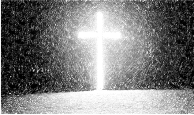
God's Light Shines Through the Cross